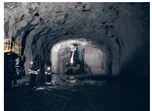
Checking the work in the machine room.