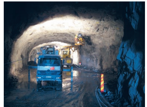
Looking into the thermal energy storage.