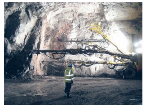
Drilling equipment at work.