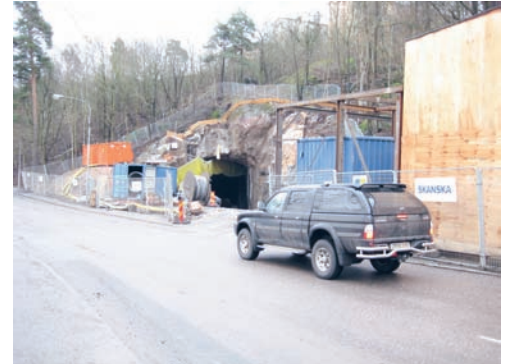
The entrance to the rock caverns.

The condenser heat from the chillers, stored during the previous day, is taken away by the district cooling return pipe and dismissed to the Baltic Sea at the existing production plants.